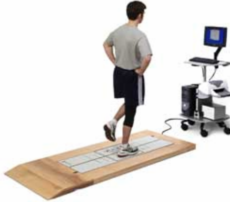
Fig. 2. Patient doing a test on the posturograph

The proposed method, which will be described in section 3, will be applied to this type of time series. The results of applying the method will be discussed in section 4, whereas the findings will be detailed in section 5. Before all this we will present work related to this article in section 2.